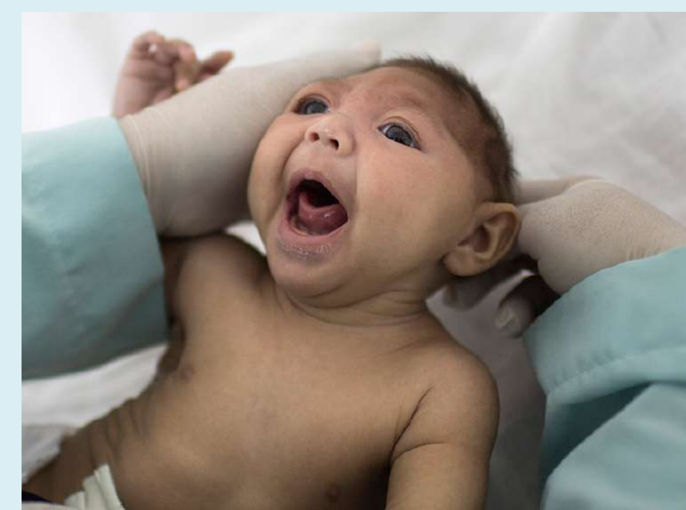
Baby born with Zika-related microcephaly.

The first clear understanding that Zika virus was indeed the main player associated with the high incidence of microcephaly in Brazil was presented in a paper published in Science magazine in May 2016, in which a group of researchers at the Institute of Biomedical Sciences at the Federal University of Rio de Janeiro and the D'Or Institute for Research and Education (IDOR) investigated the effects of Zika infection in human neural stem cells cultured as neurospheres and brain organoids. 1 The group was able to show, using innovative in vitro technology only, that Zika targets human brain cells and reduces their viability and growth, indicating that infection during pregnancy disturbs neurogenesis during human brain development. The study was recognized by the World Health Organization as the final word on the Zika virus association with the high incidence of congenital microcephaly and other abnormalities of the CNS in fetuses and newborn babies of mothers who were infected by the virus during pregnancy.